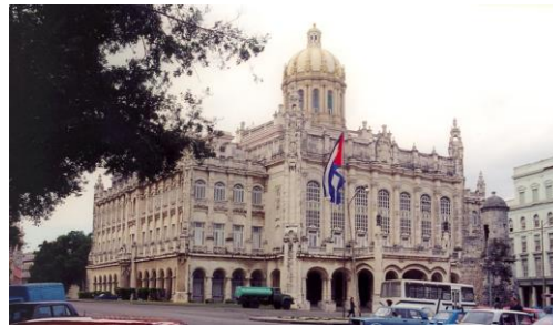
Museum of the Revolution

2:30-4:30 pm: Visit the Museums of Havana: Museum of the Revolution, Museum of Fine Arts, and the Hemingway House.