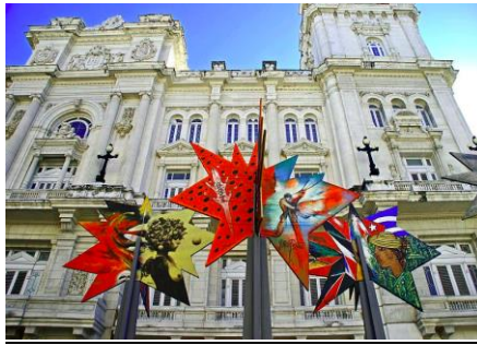
National Museum of Fine Arts