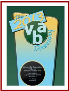
Vermont Bar Directory